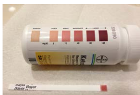
Ketone Strips (Type 1)