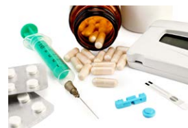
Sick Day Kit